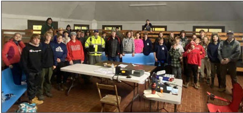
Scouts and leaders pause for a photo while working on Signs, Signals & Codes Merit Badge in mid-October.

For reservations or additional information, contact Camp Tuscazoar at 330-859-2288