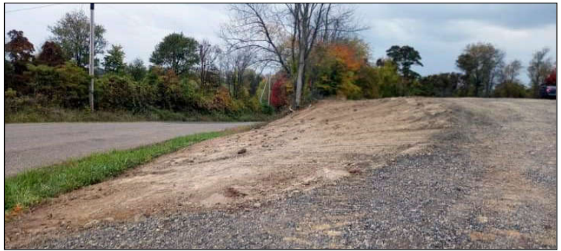
A contractor was recently hired to remove the blind spots on either side of the road at the entrance to The Preserve Trailhead as further development of this project continues.

We continue to benefit from hours of work donated by various volunteers. There is always more work that needs to be done so if you have a few extra hours, please give us a call. While we can't offer a signing bonus, the time spent at Tuscazoar is "priceless". We also have a willing volunteer each Wednesday that would love some company!