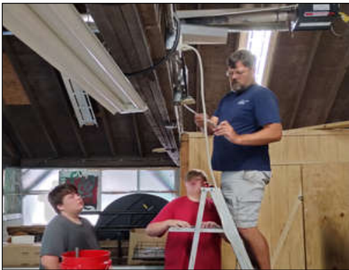
Volunteers recently installed new lights in the Kimble Dining Hall.

You may also notice when you attend our Maple Days Pancake Breakfast that the floor at the far end of Kimble Dining Hall has been replaced with a new smooth concrete surface thanks to the Kimble Foundation. And we removed the concrete ramps on either side of the main entrance that often tripped up visitors.