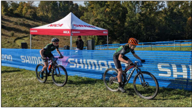
For the second consecutive year, Camp Tuscazoar hosted the OMBL series championship at The Preserve.