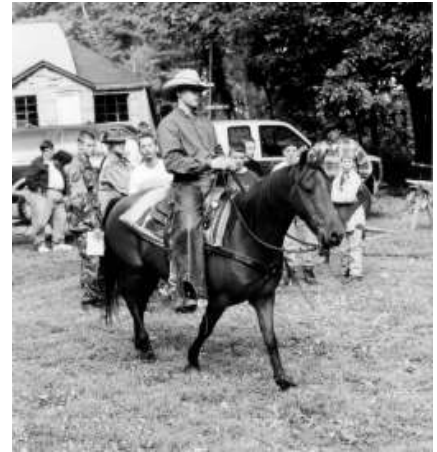
Campers watch a horseback riding demonstration in Hoover Field.

On behalf of the Board of Trustees, a big THANK YOU to all who supported this effort. We look forward to a bigger event next year.