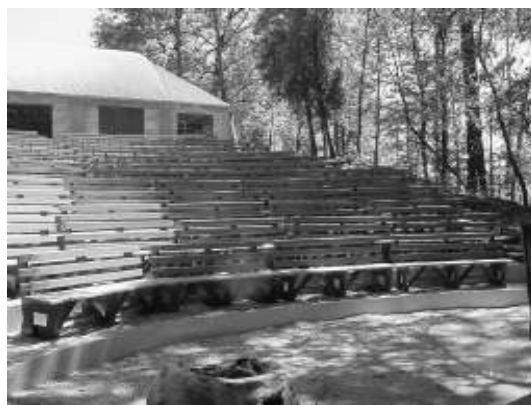
The newly-restored Hoover Amphitheater

Visitors at the Pig Gig campfire were thrilled with the new benches and the repairs to the stone risers in the Hoover Lodge amphitheater . The benches, 72 in all, were constructed by the Plastic Lumber Company in Akron. Ninety percent of the cost for