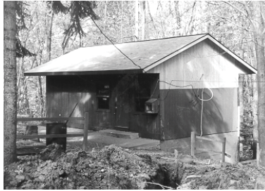
Duryee Lodge gets a new roof.

Camp Tuscazoar "Breeze" is published by the Camp Tuscazoar Foundation, Inc. P.O. Box 308 Zoarville, OH 44656-0308 http://www.tuscazoar.org