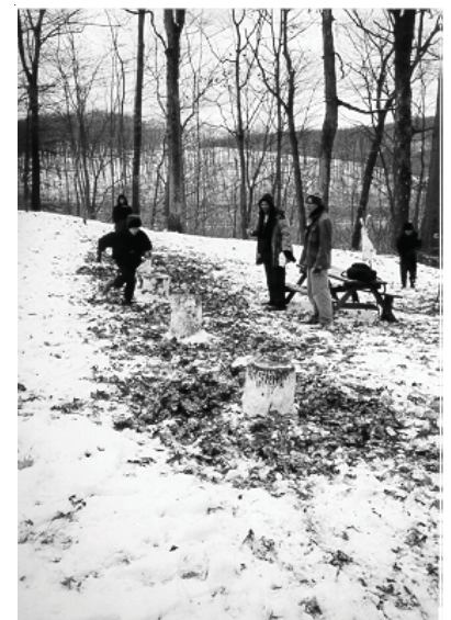
The annual Gold Rush event, set in the heart of Tuscazoar's winter woods, always provides a challenge to participants.