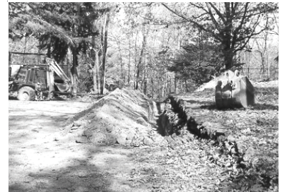
New water lines are run through the parade grounds.