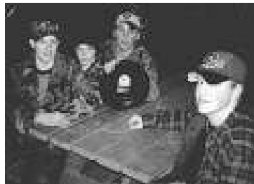
Division 1 Winners

Thanks to everyone who attended and to our event co-chairmen. Mark your calendars for next year!