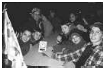
Division 3 Winners