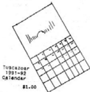
Tuscazoar 1991-92 Calendar