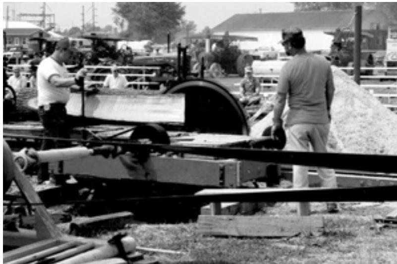
Logs from Camp Tuscazoar are sawed into lumber during the Dover Steam Show in August.

The Camp Tuscazoar Trading Post also offers a variety of Tuscazoar T-shirts, hats, patches, neckerchiefs and books on local history, including "Tuscazoar and Tales of the Tuscarawas". For details, see page 3 of the Breeze.