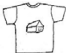
Troop 5 T Shirt $7.00