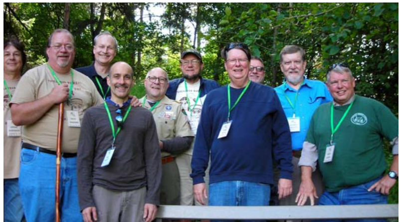
Former camp staffers pause for a photo at Pioneer Point.