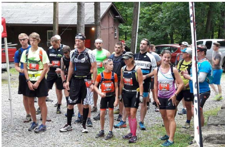
Participants gather in central camp for the start of the 17-mile Adventure Race, which took them to Zoar and back.